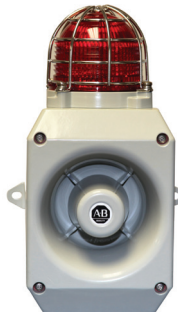
Explosion-Proof Remote Alarm EXALM-HL