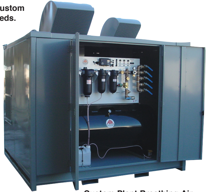
Custom Plant Breathing Air