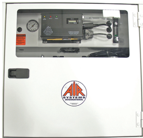
Grade-D Filtration for Clean Room Applications