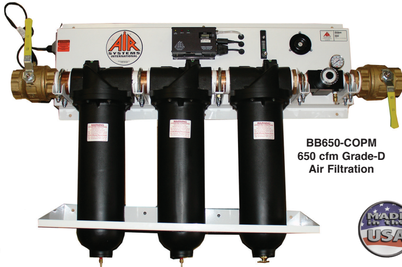
BB650-COPM 650 cfm Grade-D Air Filtration

Plant Filtration Systems Available Up To 3000 cfm