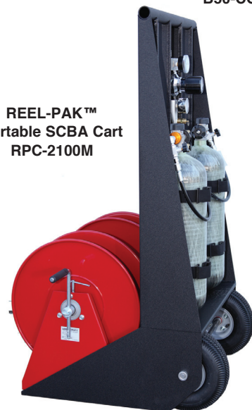
REEL-PAK™ Portable SCBA Cart RPC-2100M